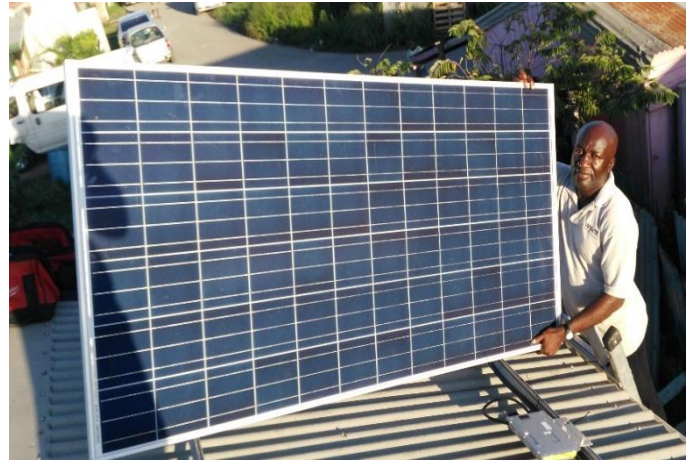
Antigua and Barbuda, 4 MW wind and solar project

IRENA and the Abu Dhabi Fund for Development (ADFD) have collaborated on a joint Project Facility. ADFD committed USD 350 million, over seven funding cycles, to renewable energy projects recommended through the IRENA/ADFD Project Facility. The first cycle commenced in November 2012. The fifth cycle opened on 11 November 2016 .