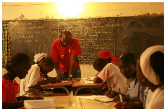
Senegal, 2 MW solar project

As the ADFD loans cover up to 50% of the project costs, the remaining finance must be leveraged from other sources.